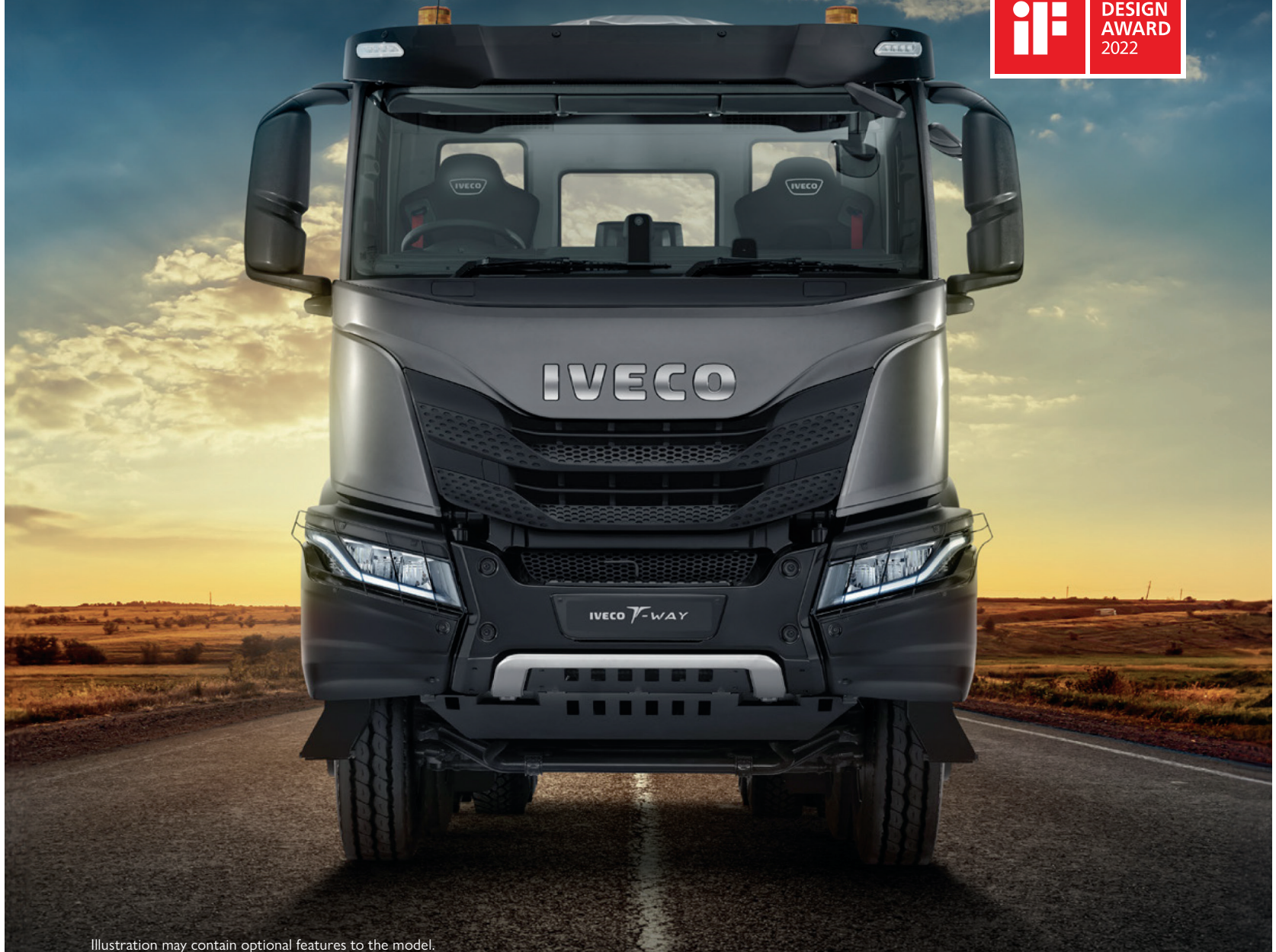
Illustration may contain optional features to the model.